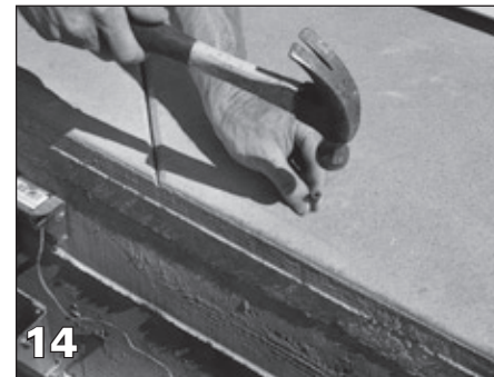
14 Remove the lid and hammer the plastic anchors (A1706) into the holes.