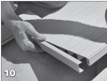
10 Attach the cut cover pieces (M9363) to both sides of the lid.