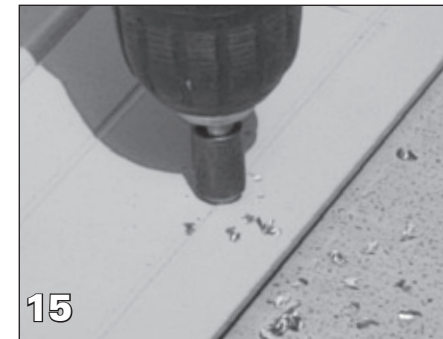
15 Countersink the drill holes in the hinge.