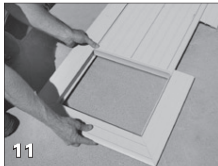
11 Slide the lid end support frame onto the hinge.