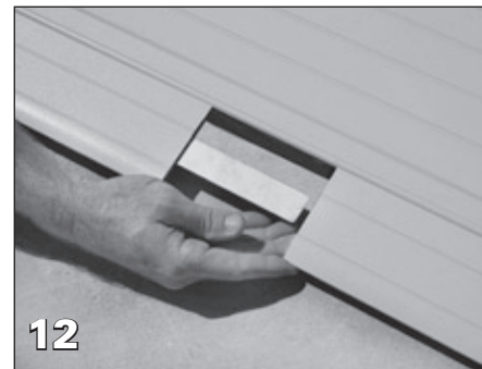
12 Insert the lid hinge splices (M9362) between each section of the lid end support and lid hinge then slide them tightly together.